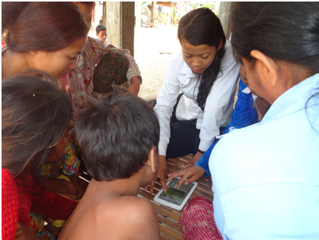
Youth educators conducting 'house-to-house' sessions to show communities World Education's new safe migration website and phone line, and to share key messages about how to migrate safely