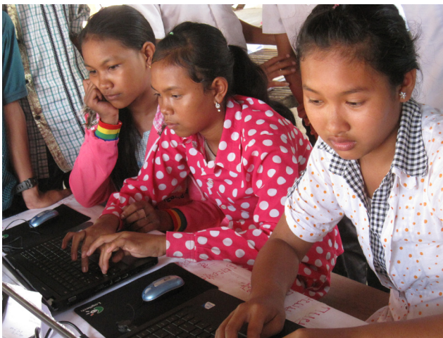
Youth at one of World Education's village-based computer centers