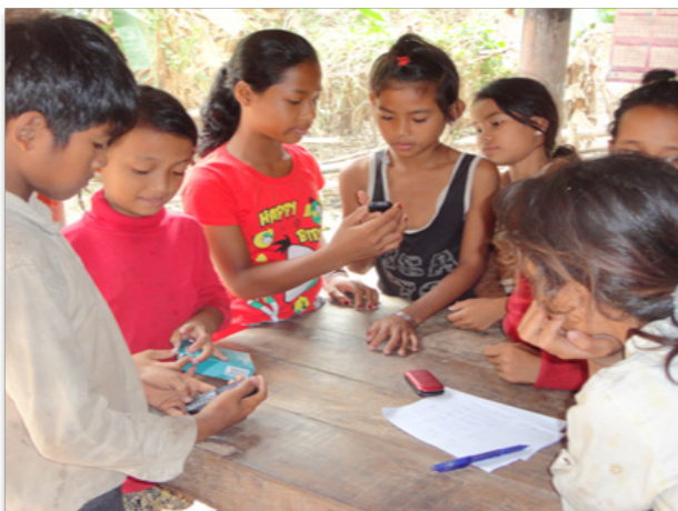
Youth learning how to use mobile phones – a skill that our impact studies have shown is highly valued by migrant youth later on

workplace safety, health, saving money, drugs and alcohol, and relationships. Every lesson includes audio recordings of the text for youth who cannot read well and the website is coupled with an Interactive Voice Response (IVR) phone line youth can call to access the same information.